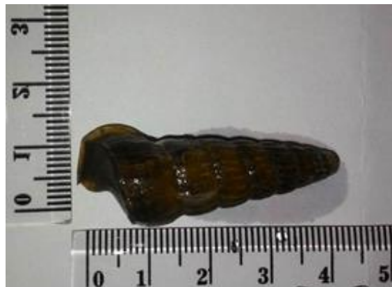
Figure 3. Terebralia sulcata

The T. sulcata species had an elongated shell like a greenish-brown trumpet with an average length of 4 cm and an average width of 1 cm to 2.5 cm, at the foot of this species did not have a valve that covers the legs and had a sticky mucus. This species is found in mud and mangrove root where there are many mangrove leaf litter.