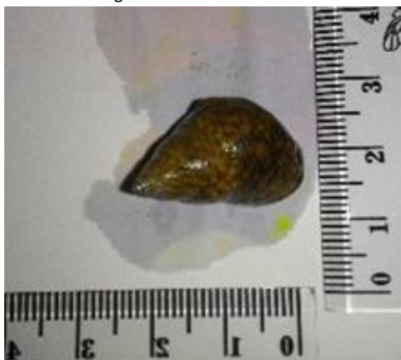
Figure 2. Littorina scabra

The species L. scabra was one of the most abundant species in the mangrove ecosystem. This species had an average size of 2.5 cm and an average width of 1 cm with a small drill-shaped shape with a white base color with stripes and dots brown. This species had a valve that opens and closes. In addition, this species had a mucus that allows this species to stick in the shadows. This species is commonly found in twigs and stems of mangroves because this species consumes mangrove leaves as food.